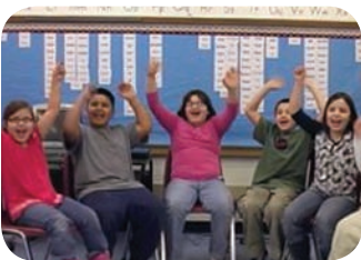
Students from schools throughout the Reservation learned about entrepreneurship at the 3rd annual Entrepreneurship Fair, held in February.