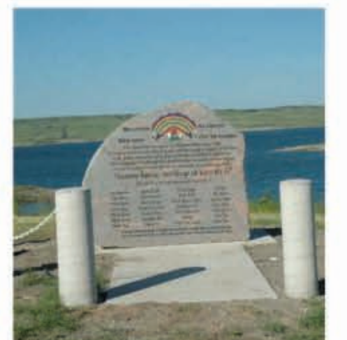
Travelers can visit repatriation monuments honoring individuals who were displaced by the construction of the Oahe Dam on the Missouri River.