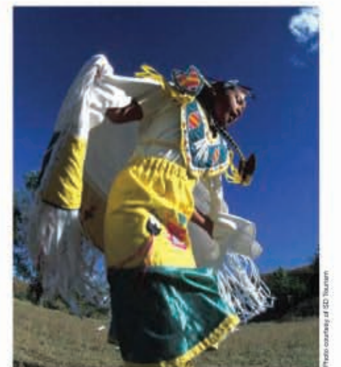
Cultural events, such as powwows, feature Lakota dancers in handmade regalia.