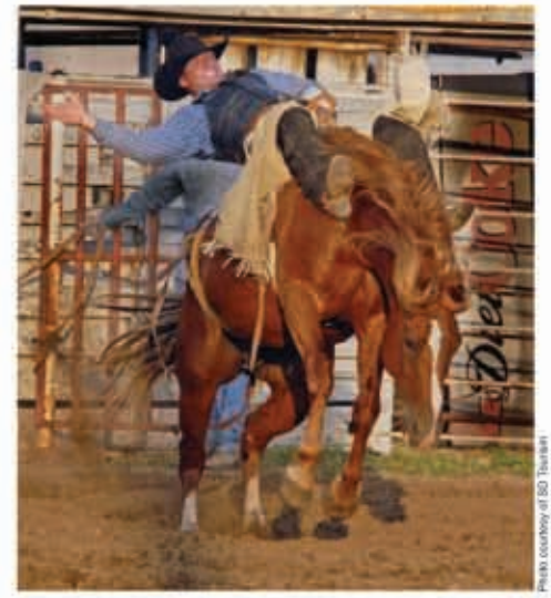
Western events, such as rodeos, are held throughout the summer months.