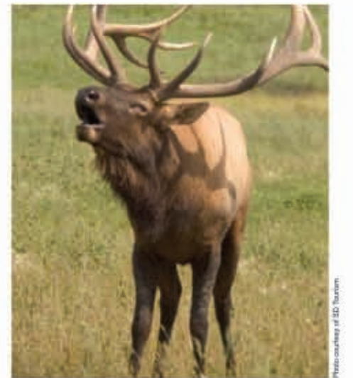
Visitors to the Reservation can take part in wildlife tours to view buffalo, elk and wild horses.