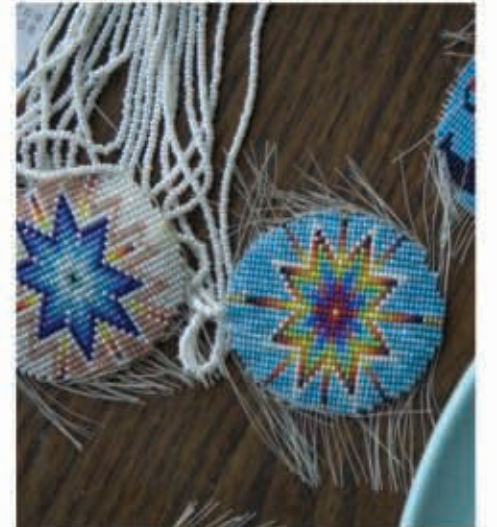
Locally made, authentic Lakota art is found in area stores and gift shops.